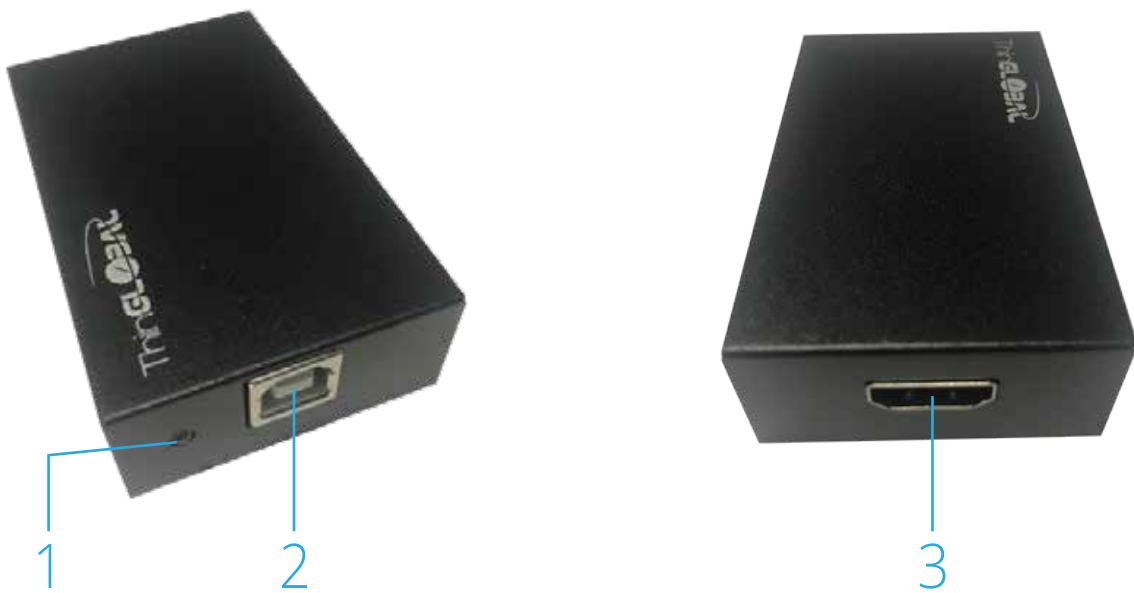
1- Power LED